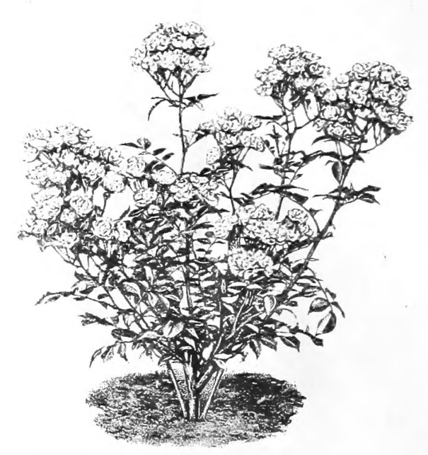
WE GUARANTEE THIS ROSE TO BE IN BLOOM EVERY DAY OUTDOORS UNTIL FROSTS, AND IF GROWN UNDER GLASS TO BE IN BLOOM EVERY DAY IN THE YEAR.

walking through the nurseries of Levavasseur & Sons at Orleans, France, was amazed to see a dwarf rose covered with clusters of roses, similar to those of the climbing and popular Crimson Rambler. At this time other roses were through flowering, so that this rose was markedly conspicuous. The little bush was fairly borne down by its tremendous covering of rich crimson roses, and was the most conspicuous as well as attractive object in this great French nursery. Upon expressing his surprise and pleasure, he was informed that it was a new creation in the Rose Kingdom, having originated with Levavasseur & Sons, and that it was a cross between the Crimson Rambler and the Glorie Polyantha Rose, possessing the habit of growth and the free blooming quality of the Polyantha Rose and color and form of the Crimson Rambler.